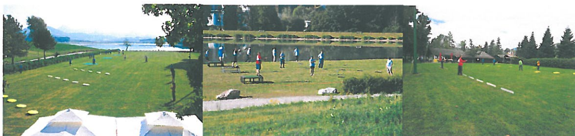
Fishing home (New casting competition center)